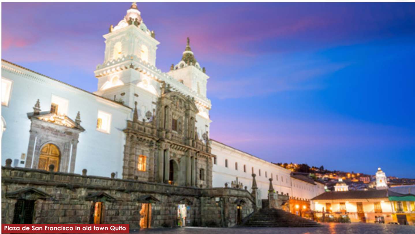
Plaza de San Francisco in old town Quito