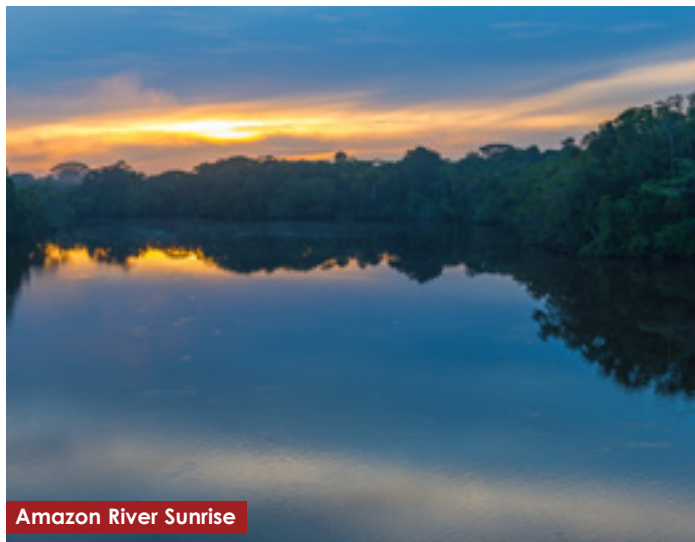
Amazon River Sunrise

local community will share firsthand, information about their culture, customs, and daily life. Prior to sunset go to the observation tower that offers a breathtaking 360-degree view of the Amazon basin. (B,L,D)