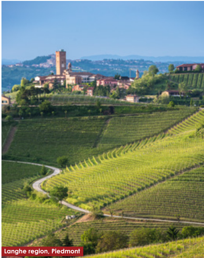
Langhe region, Piedmont