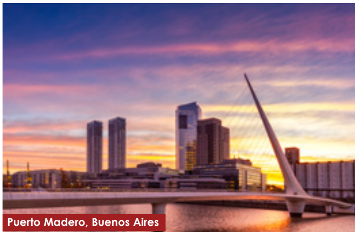
Puerto Madero, Buenos Aires

This is a guaranteed departure, seat-in-motorcoach with shared services valid for specific dates as shown above. All local flights within South America are not included and must be booked through Central Holidays.