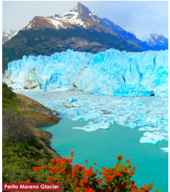
Perito Moreno Glacier